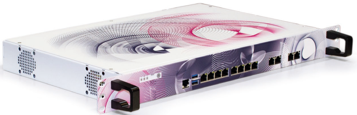
Figure shows configuration variant.