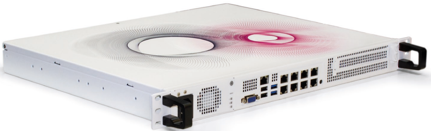
Figure shows configuration variant.