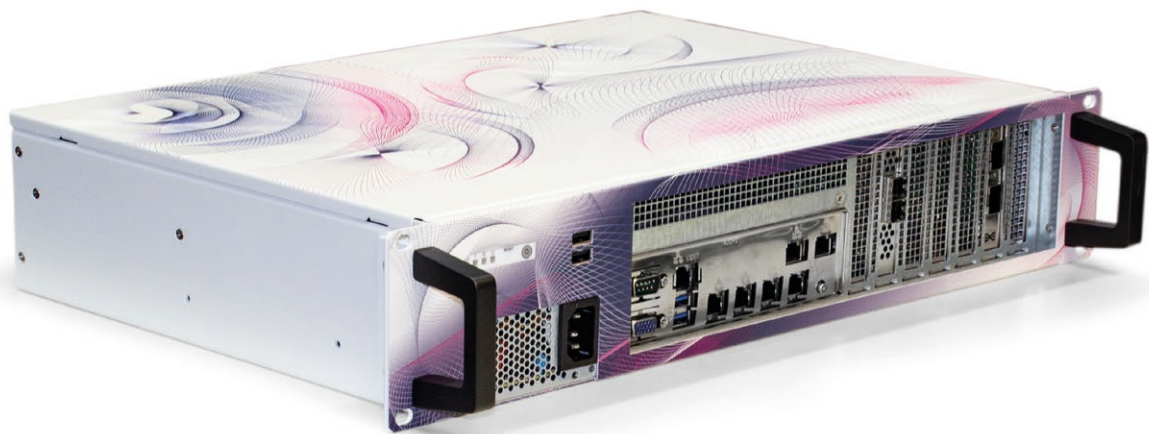
Figure shows configuration variant