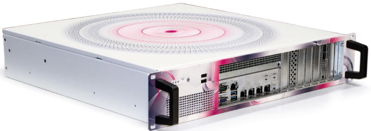
Figure shows configuration variant